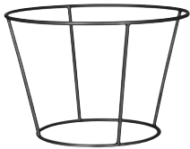
ROUND RISER - MATT BLACK