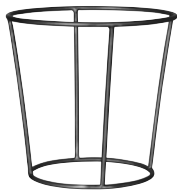
ROUND RISER - MATT BLACK