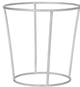
ROUND RISER - SATIN