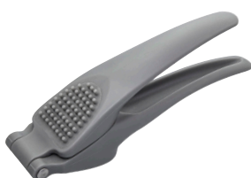
GARLIC PRESS PP & S/S EASY CLEAN