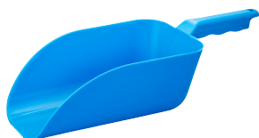
ICE SCOOP POLYCARB BLUE

Designed and created with the professional in mind, Chef Inox Serve delivers a premium and comprehensive range of commercial kitchen utensils across an impressive array of sizes. Proudly Australian, backed by decades of experience, Chef Inox uses only the highest quality materials , creating serving solutions built for long term use.