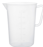
ESSENTIALS TONG S/S YELLOW