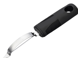
EASY GRIP PEELER S/S BLACK HANDLE