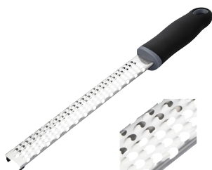
LONG PLANE FINE GRATER