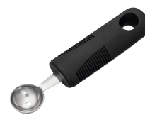
EASY-GRIP MELON BALLER S/S BLACK HDL