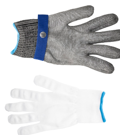
CHAIN MESH GLOVE 18/10 S/S WRIST LENGTH