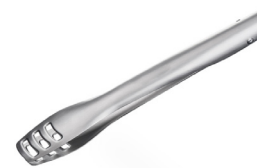
SLOTTED TIP TONGS S/S SATIN FINISH