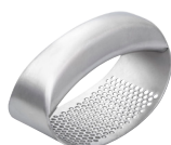
GARLIC PRESS ROCKER S/S SATIN FINISH