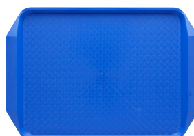
FAST FOOD TRAY RECTANGLE PP BLUE

Item Code 06987-R Width 425mm Length 300mm Height 35mm