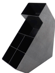
NAPKIN / STRAW / PACKET ORGANISER BLACK

Item Code 08652 Width 475mm Length 120mm Height 386mm