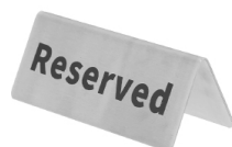
TABLE SIGN "RESERVED" S/S PACK OF 10

Item Code 81336 Width 62mm Length 55mm Pack Size 10 pc