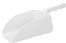
FLAT SCOOP ABS WHITE