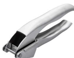
GARLIC PRESS S/S EASY RELEASE