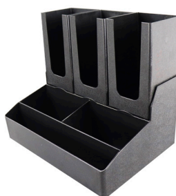
6 COMP CUP & CONDIMENT ORGANISER BLACK

Item Code 08660 Width 152mm Length 375mm Height 415mm