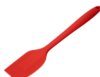
SPATULA SILICONE HEAT RESISTANT RED