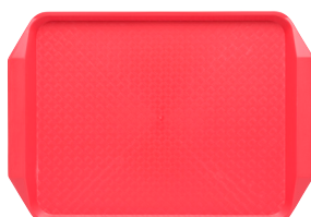
FAST FOOD TRAY RECTANGLE PP RED

Item Code 06987-GN Width 425mm Length 300mm Height 35mm