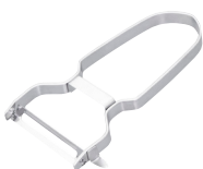
VEGETABLE SPEED PEELER S/S

Item Code 03343 Diameter 80mm Length XXXX