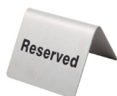
TABLE SIGN "RESERVED" S/S PACK OF 10

Item Code 81335 Width 110mm Length 110mm Pack Size 2 pc