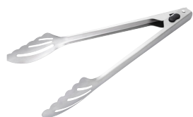
UTILITY TONGS SCALLOPED S/S

Item Code 03078 Length 246mm Finish Matt