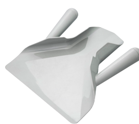
CHIP BAGGER POLYCARB DUAL HANDED

Item Code 66181 Width 210mm Length 235mm