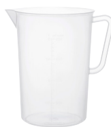
ESSENTIALS TONG S/S RED