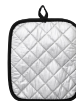
OVEN MITT W/ POCKET HEAT RESISTANT

Item Code 31589 Length 430mm Colour Red/Black Heat Resistance Up to 250°C