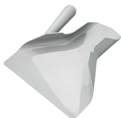
CHIP BAGGER POLYCARB RIGHT HANDED

Item Code 66180 Width 210mm Length 235mm