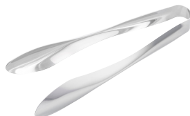
ALL PURPOSE TONG S/S