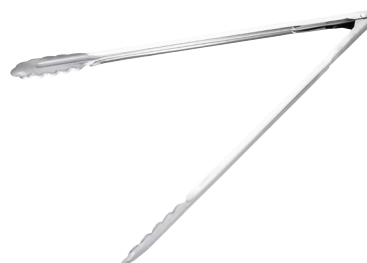
UTILITY SPRING TONG S/S