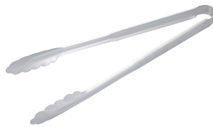
ONE PIECE TONG S/S