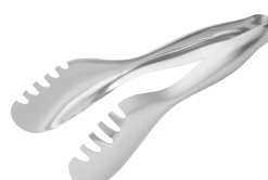
SERVING TONGS S/S

Item Code 03078 Length 246mm Finish Matt