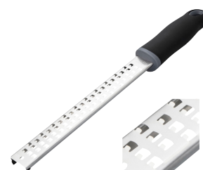
LONG PLANE COARSE GRATER