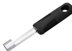
EASY-GRIP APPLE CORER S/S BLACK HANDLE