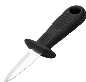
OYSTER KNIFE S/S BLACK HANDLE

Designed and created with the professional in mind, Chef Inox Serve delivers a premium and comprehensive range of commercial kitchen utensils across an impressive array of sizes. Proudly Australian, backed by decades of experience, Chef Inox uses only the highest quality materials , creating serving solutions built for long term use.