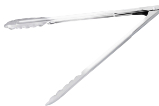
UTILITY SPRING TONG S/S