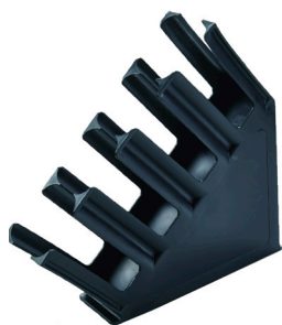
4 COMP VERTICAL CUP ORGANISER BLACK

Item Code 08650 Width 295mm Length 115mm Height 386mm