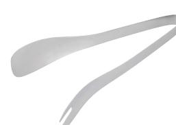
DUAL FORK & SPOON TONGS S/S

Item Code 03072 Length 250mm Finish Mirror