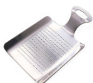
GINGER/GARLIC GRATER S/S

Designed and created with the professional in mind, Chef Inox Serve delivers a premium and comprehensive range of commercial kitchen utensils across an impressive array of sizes. Proudly Australian, backed by decades of experience, Chef Inox uses only the highest quality materials , creating serving solutions built for long term use.