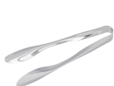
ALL PURPOSE TONG S/S

Item Code 03073 Length 250mm Finish Mirror