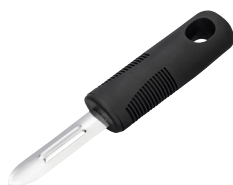
EASY-GRIP FIXED PEELER S/S BLACK HANDLE