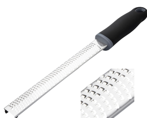
LONG PLANE LEMON ZESTER

Designed and created with the professional in mind, Chef Inox Serve delivers a premium and comprehensive range of commercial kitchen utensils across an impressive array of sizes. Proudly Australian, backed by decades of experience, Chef Inox uses only the highest quality materials , creating serving solutions built for long term use.