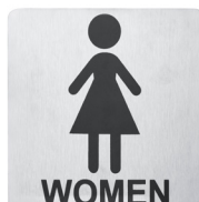
WALL SIGN "WOMEN" S/S PACK OF 2

Item Code 81330 Width 130mm Length 130mm Pack Size 2 pc