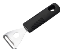
EASY-GRIP PEELER S/S BLACK HANDLE