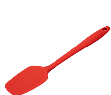
SPATULA SILICONE HEAT RESISTANT RED