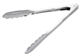
UTILITY SPRING TONG S/S