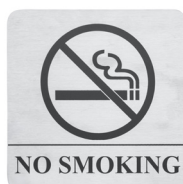
WALL SIGN "NO SMOKING" S/S PACK OF 2

Item Code 81333 Width 130mm Length 130mm Pack Size 2 pc