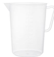
ESSENTIALS TONG S/S PURPLE