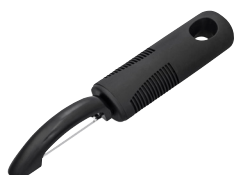
EASY-GRIP PEELER S/S BLACK HANDLE

Item Code 33011 Width 102mm Length 153mm