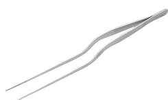
OFFSET TWEEZER S/S