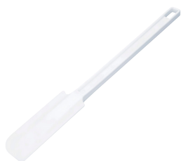
RUBBER BLADE SPATULA WHITE