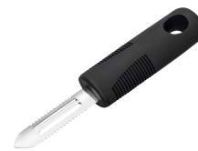
EASY-GRIP FIXED PEELER W/ FISH SCALER S/S