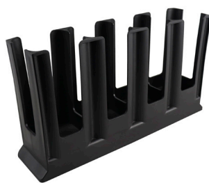
8 COMP VERTICAL CUP ORGANISER BLACK

Item Code 08650 Width 295mm Length 115mm Height 386mm