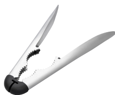
SEAFOOD / NUT CRACKER S/S PP TIP