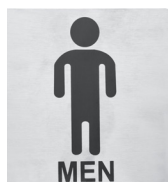
WALL SIGN "MEN" S/S PACK OF 2

Designed and created with the professional in mind, Chef Inox Serve delivers a premium and comprehensive range of commercial kitchen utensils across an impressive array of sizes. Proudly Australian, backed by decades of experience, Chef Inox uses only the highest quality materials , creating serving solutions built for long term use.