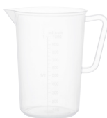
MEASURING JUG GRADUATED PP