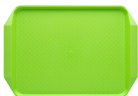
FAST FOOD TRAY RECTANGLE PP GREEN

Item Code 06987-GN Width 425mm Length 300mm Height 35mm