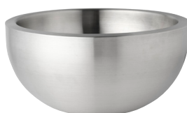
MIXING/SERVE BOWL DOUBLE WALL S/S

Item Code 70590 Max. Diameter 150mm Height 85mm Capacity 600ml