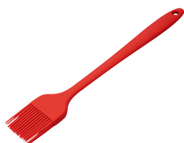
PASTRY BRUSH SILICONE HEAT RESISTANT RED