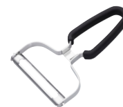
VEGETABLE PEELER S/S BLACK RUBBER HANDLE

Item Code 03005-BK Width 52mm Length 215mm