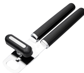
CAN OPENER S/S THERMO BLACK HDL

Item Code 03005-BK Width 52mm Length 215mm