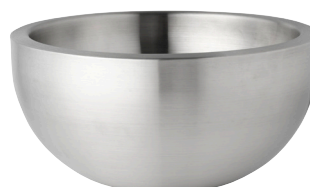
MIXING/SERVE BOWL DOUBLE WALL S/S

Item Code 70591 Max. Diameter 200mm Height 115mm Capacity 1.0L