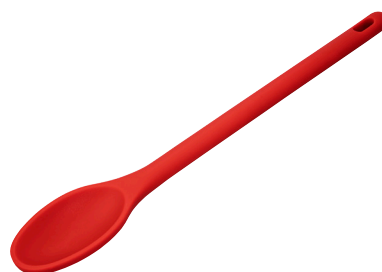
MIXING SPOON NYLON HIGH HEAT RED