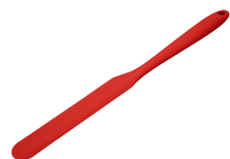
JAR SPATULA SILICONE HEAT RESISTANT RED