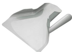
CHIP BAGGER POLYCARB LEFT HANDED

Designed and created with the professional in mind, Chef Inox Serve delivers a premium and comprehensive range of commercial kitchen utensils across an impressive array of sizes. Proudly Australian, backed by decades of experience, Chef Inox uses only the highest quality materials , creating serving solutions built for long term use.