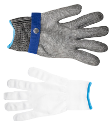
CHAIN MESH GLOVE 18/10 S/S WRIST LENGTH