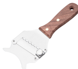
TRUFFLE GRATER WOOD HANDLE