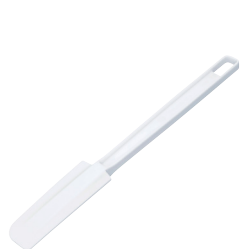
RUBBER BLADE SPATULA WHITE

Designed and created with the professional in mind, Chef Inox Serve delivers a premium and comprehensive range of commercial kitchen utensils across an impressive array of sizes. Proudly Australian, backed by decades of experience, Chef Inox uses only the highest quality materials , creating serving solutions built for long term use.