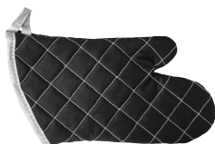
OVEN MITT FLAME RETARDENT

Item Code 31586 Length 330mm Colour Black