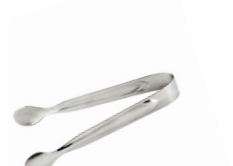
SUGAR CUBE TONGS S/S