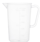
ESSENTIALS TONG S/S BLUE

Designed and created with the professional in mind, Chef Inox Serve delivers a premium and comprehensive range of commercial kitchen utensils across an impressive array of sizes. Proudly Australian, backed by decades of experience, Chef Inox uses only the highest quality materials , creating serving solutions built for long term use.