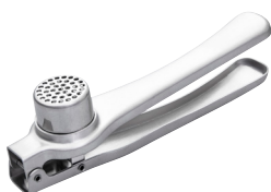
GARLIC PRESS S/S