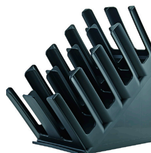
4 COMP HORIZONTAL CUP ORGANISER BLACK

Item Code 08653 Width 440mm Length 370mm Height 450mm