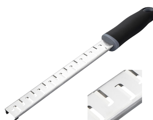
LONG PLANE RIBBON GRATER