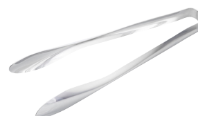
ALL PURPOSE TONG S/S