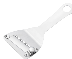
CHOCOLATE / TRUFFLE SLICER S/S