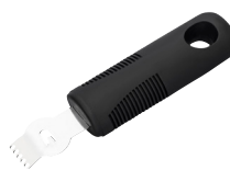
EASY-GRIP ZESTER S/S BLACK HANDLE