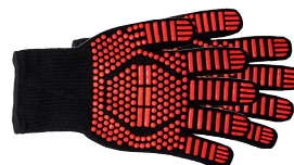
OVEN GLOVES - PAIR FLAME RETARDENT

Item Code 31587 Length 430mm Colour Black