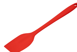
SPATULA SILICONE HEAT RESISTANT RED