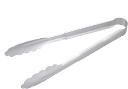
ONE PIECE TONG S/S

Designed and created with the professional in mind, Chef Inox Serve delivers a premium and comprehensive range of commercial kitchen utensils across an impressive array of sizes. Proudly Australian, backed by decades of experience, Chef Inox uses only the highest quality materials , creating serving solutions built for long term use.