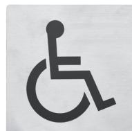
WALL SIGN "DISABLED" S/S PACK OF 2

Item Code 81331 Width 130mm Length 130mm Pack Size 2 pc