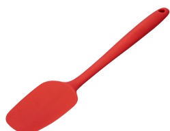
SPATULA SILICONE HEAT RESISTANT RED