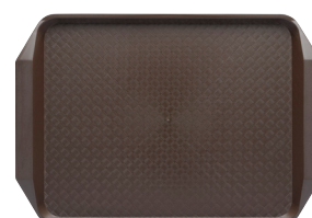
FAST FOOD TRAY RECTANGLE PP BROWN

Item Code 06987-BL Width 425mm Length 300mm Height 35mm