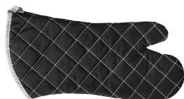
OVEN MITT FLAME RETARDENT

Item Code 31586 Length 330mm Colour Black