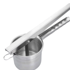
POTATO PRESS 18/10 S/S

Item Code 03343 Diameter 80mm Length XXXX