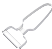
VEGETABLE SPEED PEELER S/S