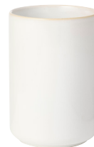
URBAN SERVE WHITE UTENSIL HOLDER

Item Code 908489 Max. Diameter 97mm Height 142mm Capacity 650ml