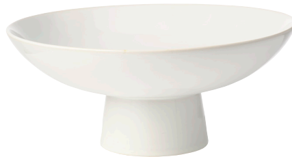
URBAN SERVE WHITE PEDESTAL FLARE BOWL

Item Code 908466 Max. Diameter 157mm Height 95mm