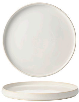
URBAN SERVE WHITE ROUND PLATE

Meet Tablekraft's new presentation collection , Urban Serve. This stunning range features warm white hues, elegantly banded with subtle neutrals . The collection boasts footed stands , irregular platters, walled plates and innovative sauce solutions - perfect for impressive event buffets, bustling bakeries, chic cafes and beyond.