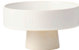
URBAN SERVE WHITE PEDESTAL DEEP PLATE

Item Code 908461 Max. Diameter 290mm Height 147mm