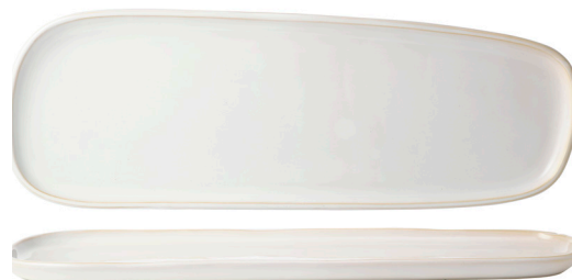
URBAN SERVE WHITE IRREGULAR PLATE LARGE

Item Code 908458 Width 460mm Length 265mm Height 23mm