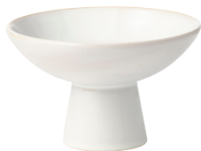
URBAN SERVE WHITE PEDESTAL FLARE BOWL

Item Code 908464 Max. Diameter 200mm Height 115mm