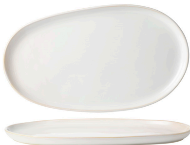
URBAN SERVE WHITE IRREGULAR PLATE SMALL

Item Code 908455 Width 430mm Length 312mm Height 34mm