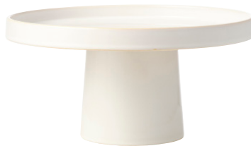
URBAN SERVE WHITE PEDESTAL PLATE

Item Code 908460 Max. Diameter 146mm Height 72mm