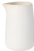
URBAN SERVE WHITE TALL CREAMER

Item Code 908488 Max. Diameter 84mm Height 124mm Capacity 400ml