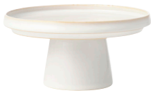
URBAN SERVE WHITE PEDESTAL PLATE

Meet Tablekraft's new presentation collection , Urban Serve. This stunning range features warm white hues, elegantly banded with subtle neutrals . The collection boasts footed stands , irregular platters, walled plates and innovative sauce solutions - perfect for impressive event buffets, bustling bakeries, chic cafes and beyond.