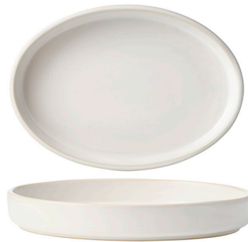
URBAN SERVE WHITE OVAL PLATE

Item Code 908453 Max. Diameter 300mm Height 78mm