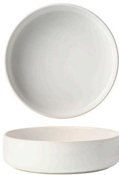
URBAN SERVE WHITE ROUND BOWL

Item Code 908450 Max. Diameter 310mm Height 30mm